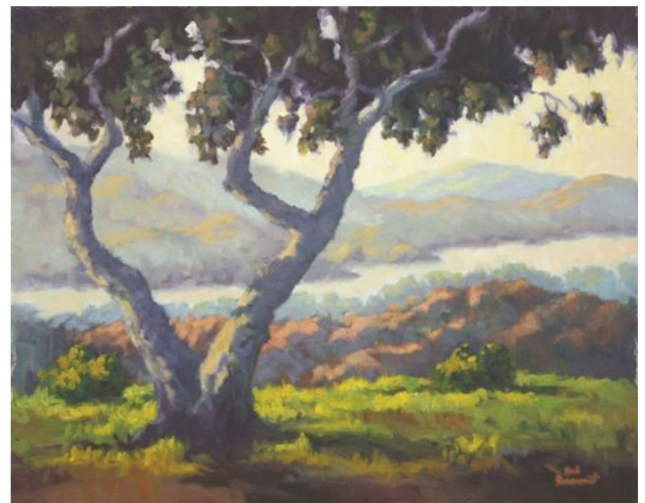
Mark Monsarrat - Crystal Springs Overlook