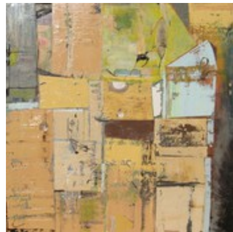
Zoya Scholis - Laundry Day

Zoya Scholis' Laundry Day was accepted into the Triton Statewide Competition/Exhibition.