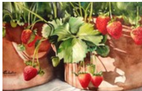
Diane Fujimoto - Beaux Arts Berries

Diane Fujimoto has a solo exhibit at the Los Altos Library through September 30.