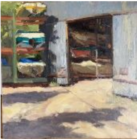
Nancy Takaichi - Racked Up

Nancy Takaichi received "Best in Show" at the North Tahoe Plein Air Open for her 12x12 inch oil, Racked Up .