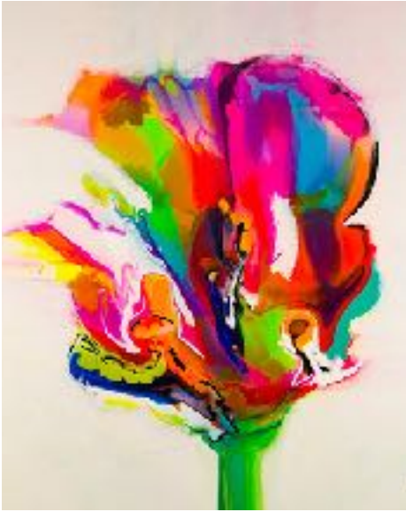
Danielle Dufayet - WILD

Danielle Dufayet's piece, WILD , was accepted into the Color Speaks Art Show in Berkeley. They also used it as the poster art!