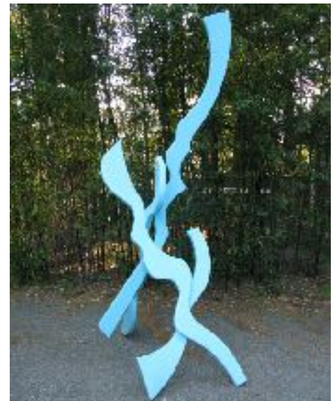
Sid Dunton - Fuego Azul

Sid Dunton's sculpture Fuego Azul is being displayed in the Sierra Azul nursery along with ninety plus others through October 31. The beautiful Nursery and Gardens are a delight to walk through and is located at 2660 East Lake Ave., Watsonville (Highway 152, across from the fairgrounds). His wall piece, Diamonds , has been selected in the members' exhibition of Pajaro Valley Arts. And Flowers is on display at the Pacific Art League in Palo Alto.