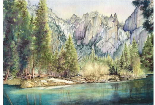
"Valley Floor - Spring" by Marian Gault

commissions and teaches workshops on various styles of calligraphy.